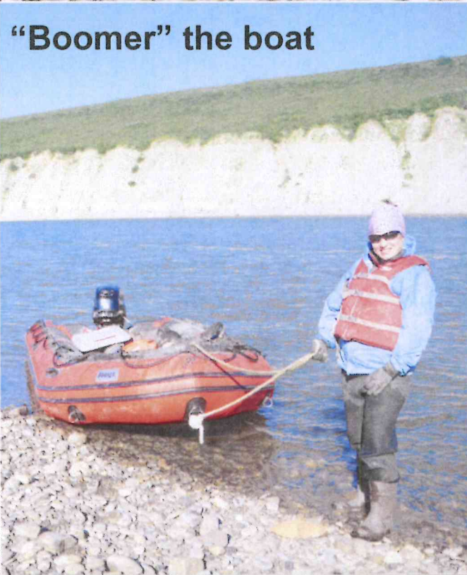
“Boomer” the boat