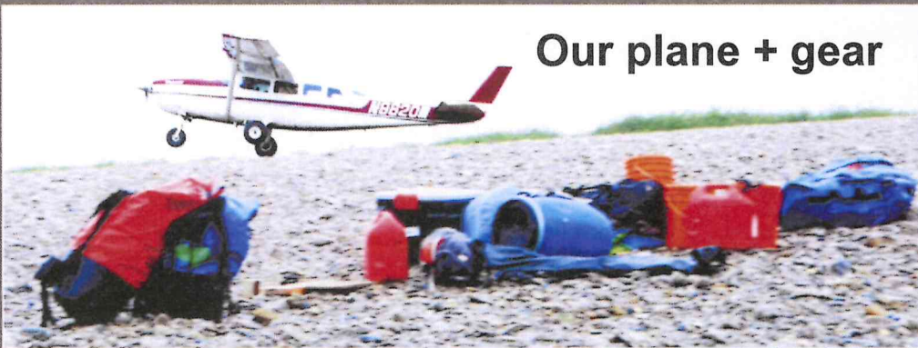
Our plane + gear